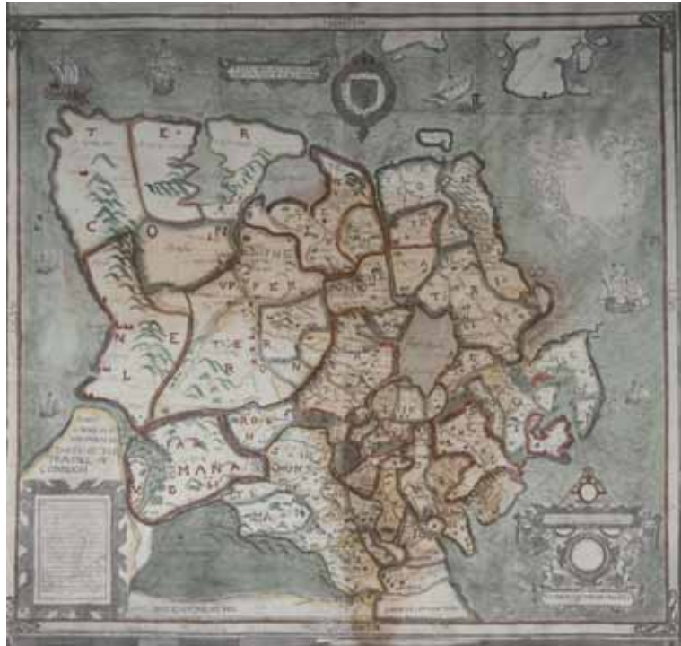
Provincia Ultonia by J. Janssonium c. 1659

In the late 16th century Ireland was divided politically and culturally into English and Gaelic parts. The West and North were predominantly Irish with scattered nomadic settlements and a pastoral economy based on farming. Numerous English style towns and villages existed around Dublin, in an area known as the 'English Pale', however the Gaelic language and local customs were beginning to spread among them. It became hugely important for the Crown to protect its interests in Ireland and expand English law and customs.