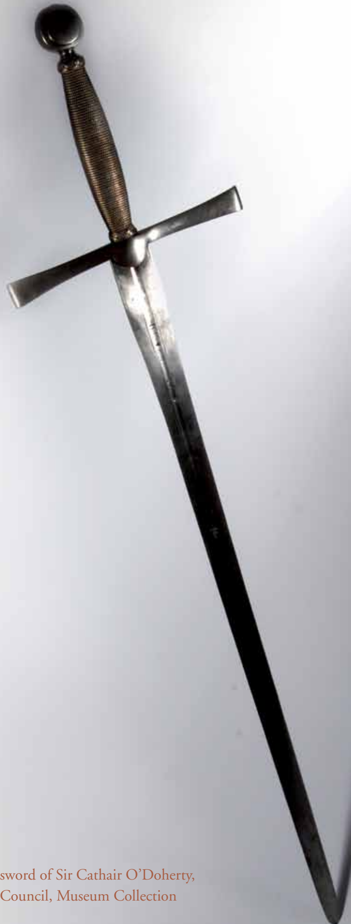
Reputedly the sword of Sir Cathair O'Doherty, Derry City Council, Museum Collection

The threat of future rebellions against the Plantation had been removed and the demography of Ireland would be transformed forever by changes in the physical and economic nature of society. Most significantly it resulted in the creation of large communities with a distinctive British and Protestant identity.